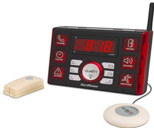
AL 10 (Base unit)

Please note that only phone, doorbell and alarm clock functions are included with Alertmaster system. Additional accessories sold separately.